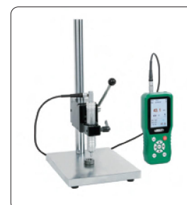
stand (optional), suitable for measuring small workpieces, fast and stable