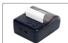
bluetooth printer (included in 9646-301)